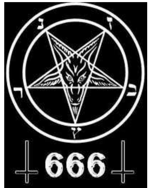
Witchcraft and occultism are gaining grounds in the world and many are naively drawn to them with a desire for worldly success. This is a trap.

Jesus asked what would profit a man if he gains the whole world but loses his soul. This question shall be so relevant in the advent of the anti Christ. The Bible in Revelations 13 presents us with facts that shall soon come upon humanity. A well acclaimed world leader with a strong satanic background shall create a new world order as he brings a temporal peace and creates a seemingly prosperous system for all. This despot shall be anti religious but demand self worship. People shall be required to bow to his image that may be in the form of a statue or picture, receive his mark or number which is 666 on their forehead or right hand for social security reasons and as condition for any form of financial transaction. These measures shall be compulsory for all. The Bible warns humanity from any such practices and makes it clear that those who succumb to them shall be selling their souls to the devil. They shall be tormented in the lake of fire forever and ever.