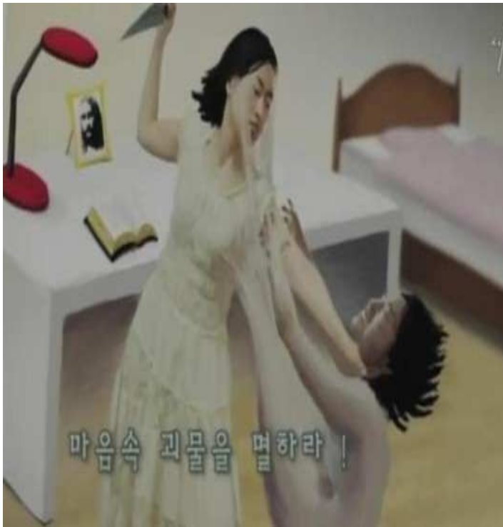
You must kill any devil that is living inside of you.