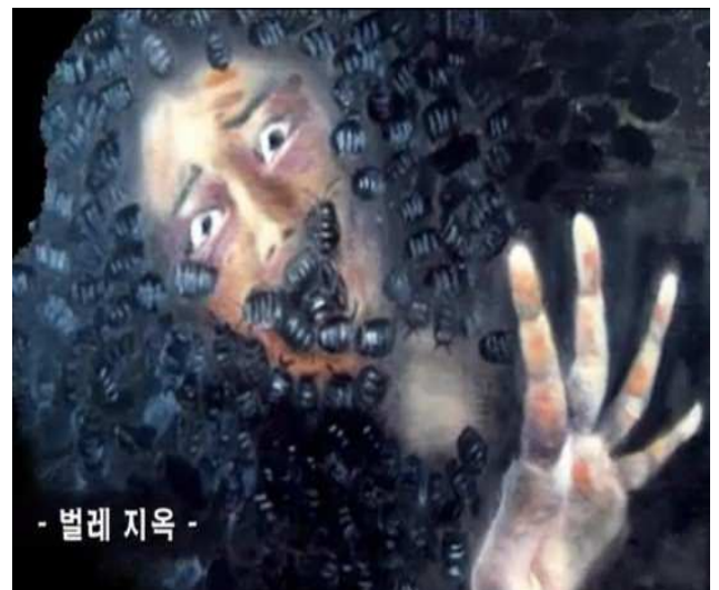
Insects in Hell: These insects are for people who committed sins by their thoughts. They were filled with their own thoughts and knowledge. Covered by countless maggots, their entire body is wounded by large insects; going in and out of the whole body, mouth, ears and head.