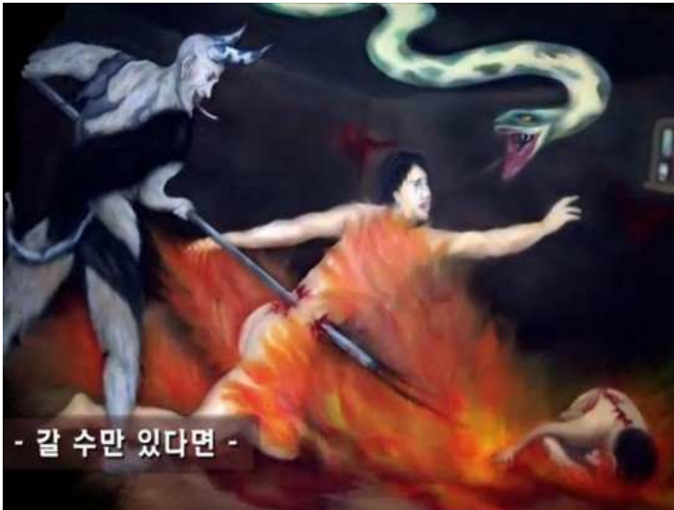
This woman tries desperately to escape.