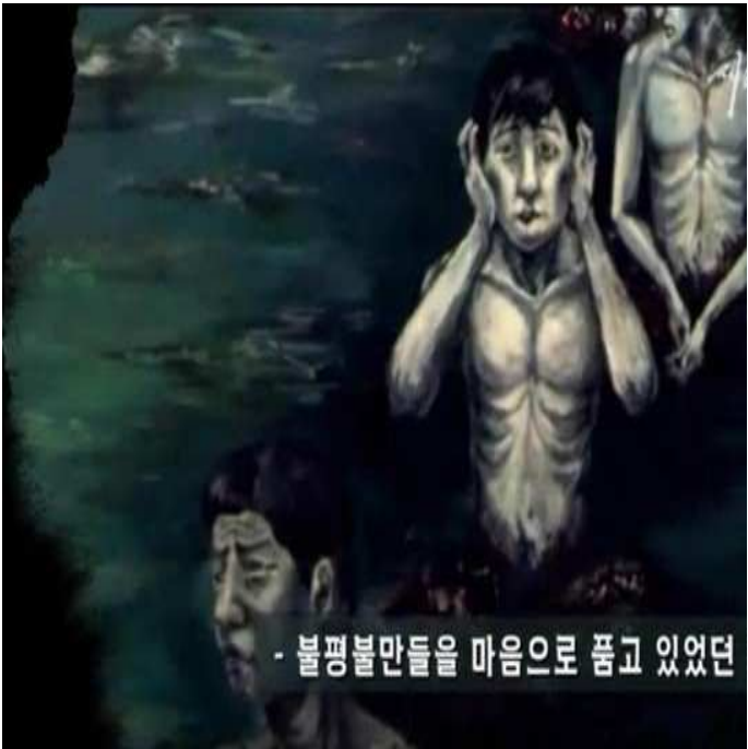
Grumblers and complainers in their heart.