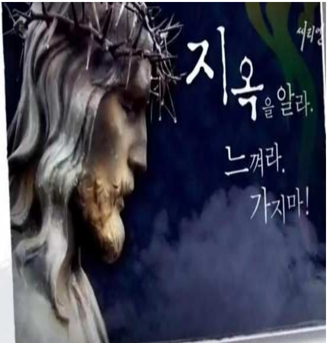
Don't go to Hell!!!