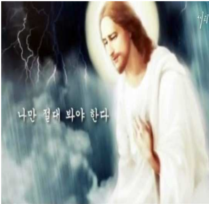
Jesus said, " Focus on Me. You must focus only on Me. "