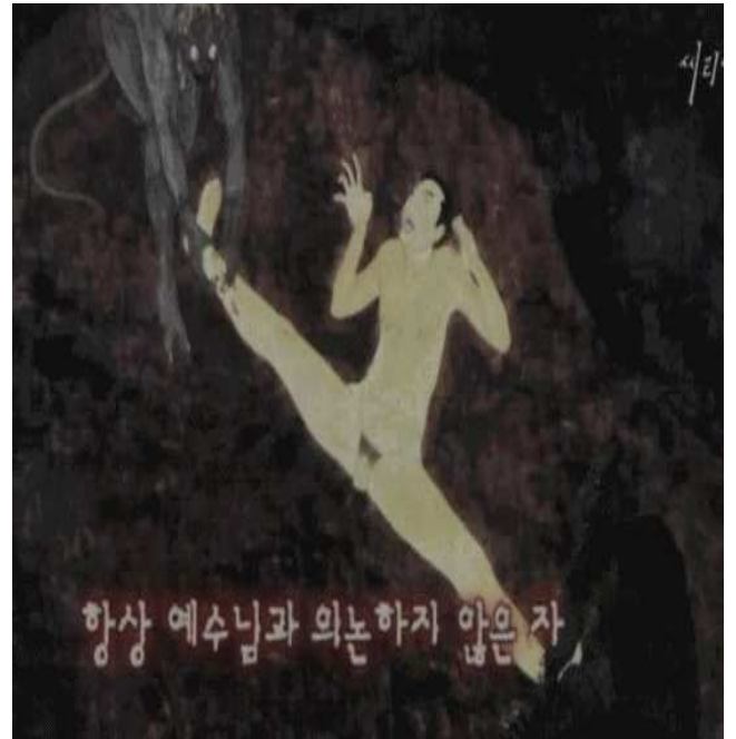
There were people who would not discuss the things of their lives with Jesus, but made their own decisions, and followed their own will.