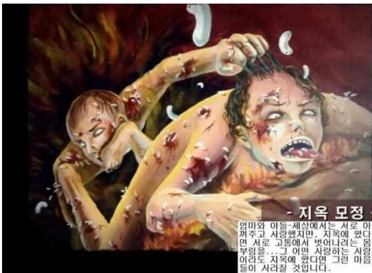
In Hell, I saw a woman and her son who had died. In Hell they no longer loved each other. Because of the unbearable pain, they would do anything to escape the torment, even by stepping on each other.