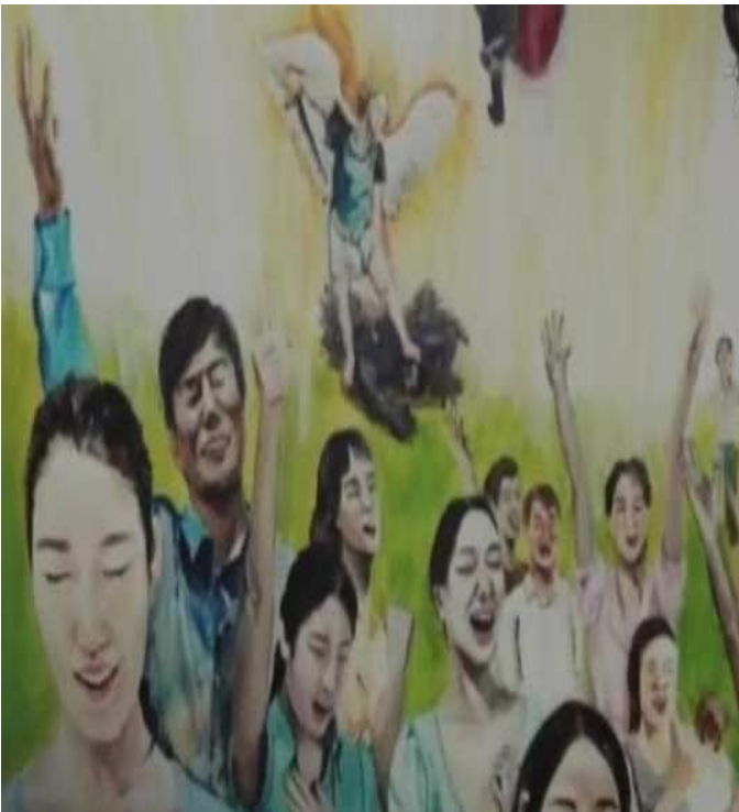
When we repent and pray before God, angel armies come down and pierce the demons with their swords.