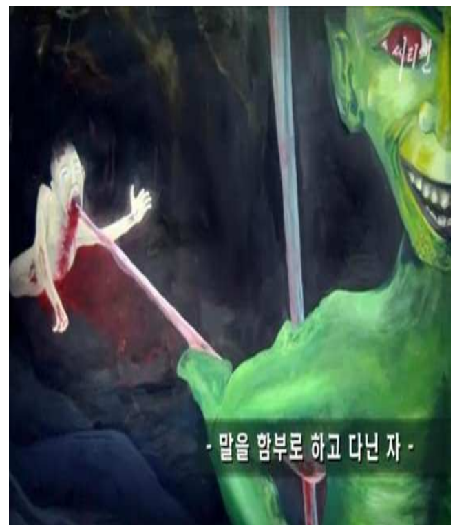
Jesus: Please tell people who hurt each other's hearts by their words that they must not hurt or wound their brothers/sisters in Christ. They must not say things without care or love.