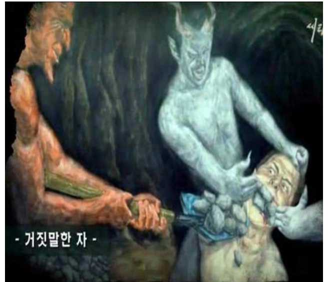
The punishment for liars.