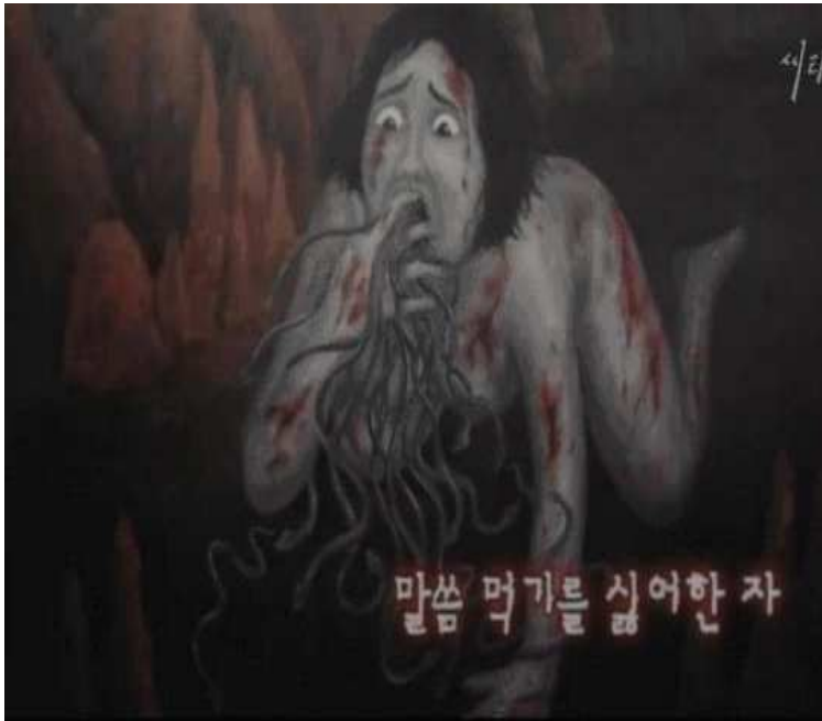
I saw people who did not want to eat the bread of life (God's Word). There were people who drank and ate prohibited things.