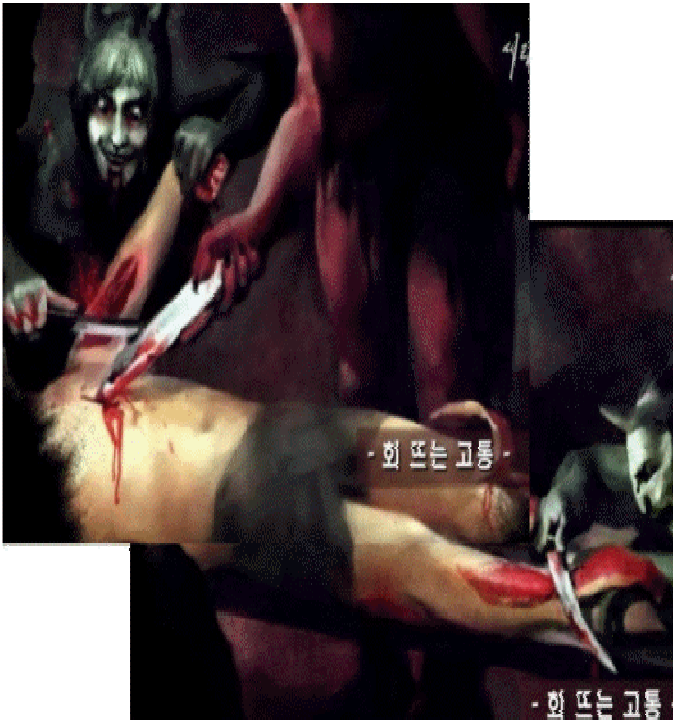
This torment was for the people who had ignored God's word and still continued to commit sin. They are the ones who performed evil in the eyes of the Lord.