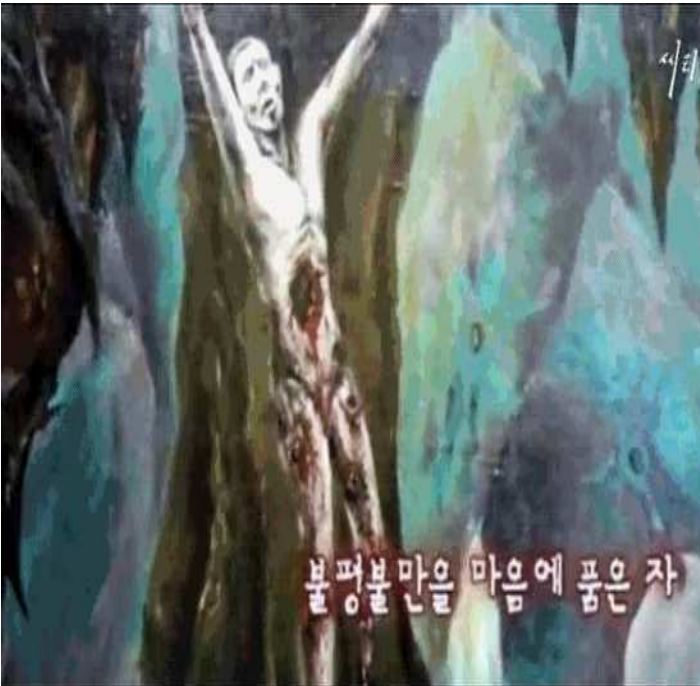
Grumblers and complainers also wound up in Hell (1st Corinthians 10:10).