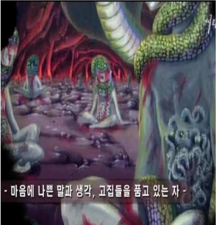
For those who worshiped idols, those that had evil thoughts and were stubborn in their ways.