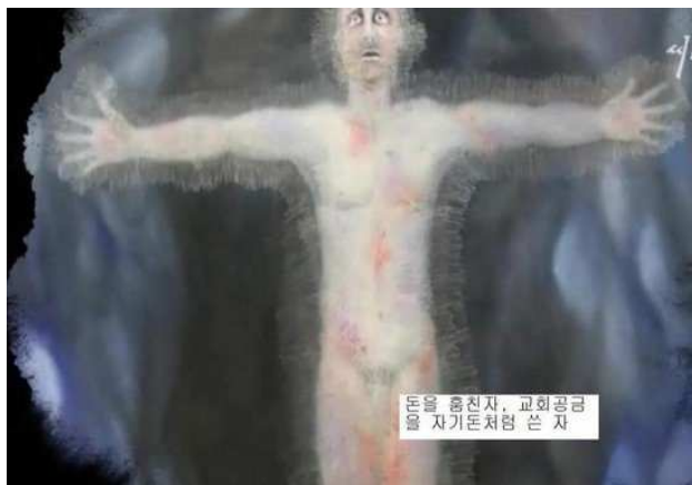
Those people who stole money are penetrated by arrows and needles.