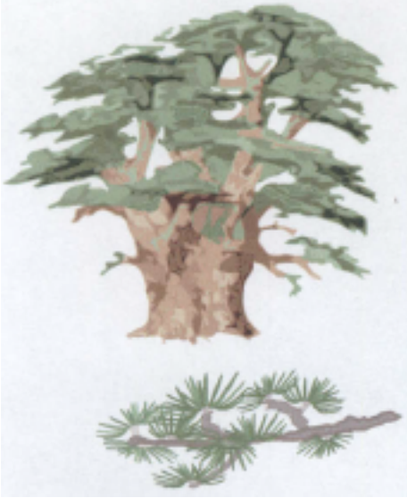
Cedar Lebanese (Cedrus Libani)